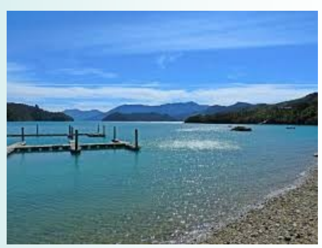
Saturday 13<sup>th</sup> Portage to Havelock

We are now rowing in the Kenepuru Sound, an entirely different stretch of water. It is shallower, a different colour, and there is less marine traffic. A 26km row from Portage to Havelock, with a coffee stop at Raetihi Lodge.